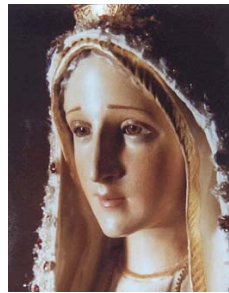
Our Lady of Fatima